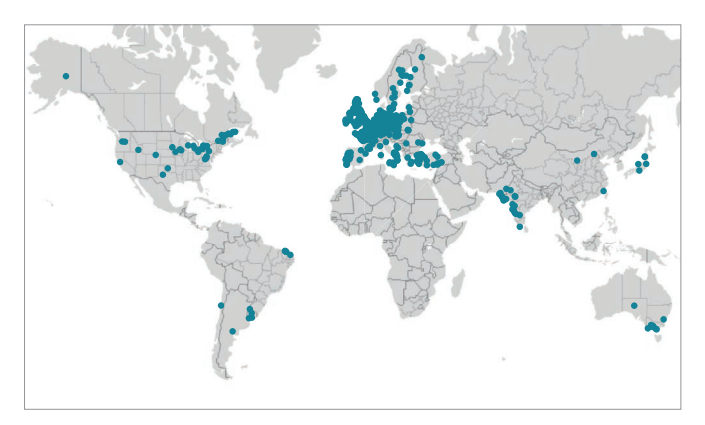
Operating sites (onshore and offshore) of evaluated wind-turbine fleet

Status July 2022